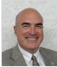
District Peace & Conflict Resolution Chair