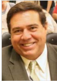
District Rotary Youth Exchange Chair