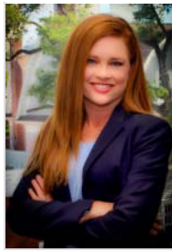
District COG, Chancellor