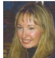
District Assistant Governor AG