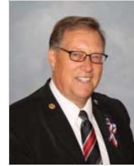
District RLI Chair