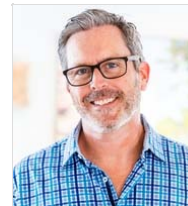
District Governor-Nominee Designate