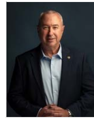
District Membership Chair