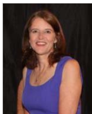
District Assistant Governor AG